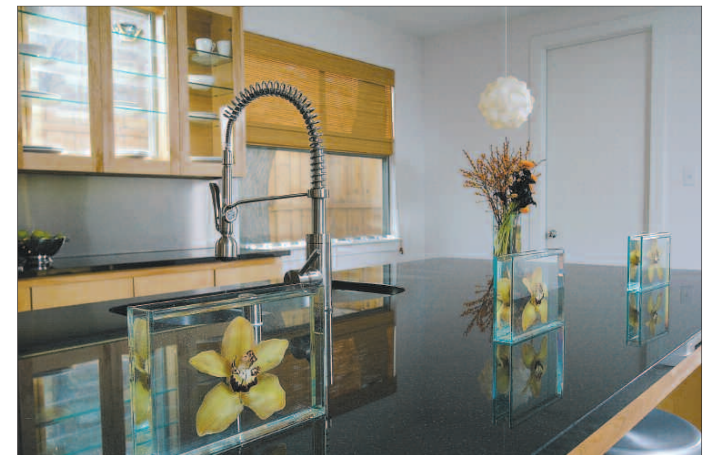
Striking orchid arrangements from Cymbidium Flowers dress up the kitchen's sleek black-granite countertops.

stashed two chrome bar stools bought with a Crate & Barrel gift certificate. It's apparent the couple is extroverted: The bedrooms have little more than a mattress and reading lamp, while the common areas are covered. In the living room, where they spend the most time, they splurged on a B & B Italia sofa and coffee tables, remote-control fireplace and top-of-the-line television and cowhide rug. For the rest of the house they had to watch the wallet. They hit up Ikea to fill Joe's office off the entry with inexpensive, stylish furnishings including a metal desk, filing cabinet and cowhide rug. A surfboard, colorful oil painting by a childhood artist friend and a DIY cubby case filled with blueprints add personality to the den's minimalist decor. The dining room and kitchen are also sleek and simple. Each room pairs an Ikea table and chairs with a higher-end hanging light — a Lightning Bug chandelier from Porter Lighting in Addison for the dining room and an IQ Light by Holger Strom from eBay for the kitchen nook. To add some extra oomph, Kelle hung her own artwork — scraps of plywood she scored from Joe's job sites and painted. "I'm just trying to fill all the white space in our house until we can collect real art," says Kelle. "But nice furniture and art will always be our thing. We'll get there one day."