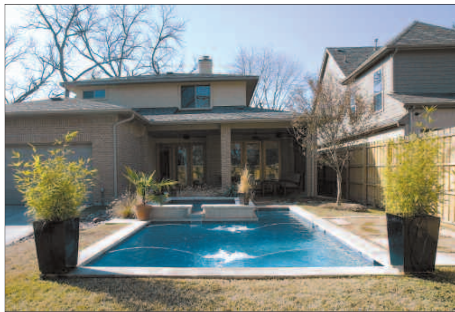
The back yard follows the home's contemporary flow with lots of bamboo, sleek Ikea metal pots and a custom streamlined pool and spa.