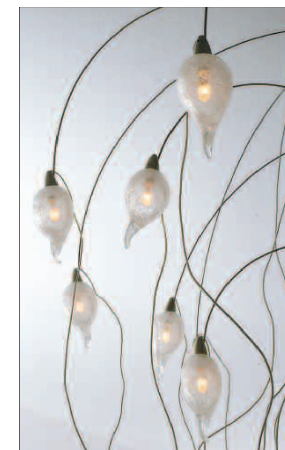
A steel Lightning Bug chandelier with frosted Italian-glass teardrop bulbs sparkles in the stark dining room.