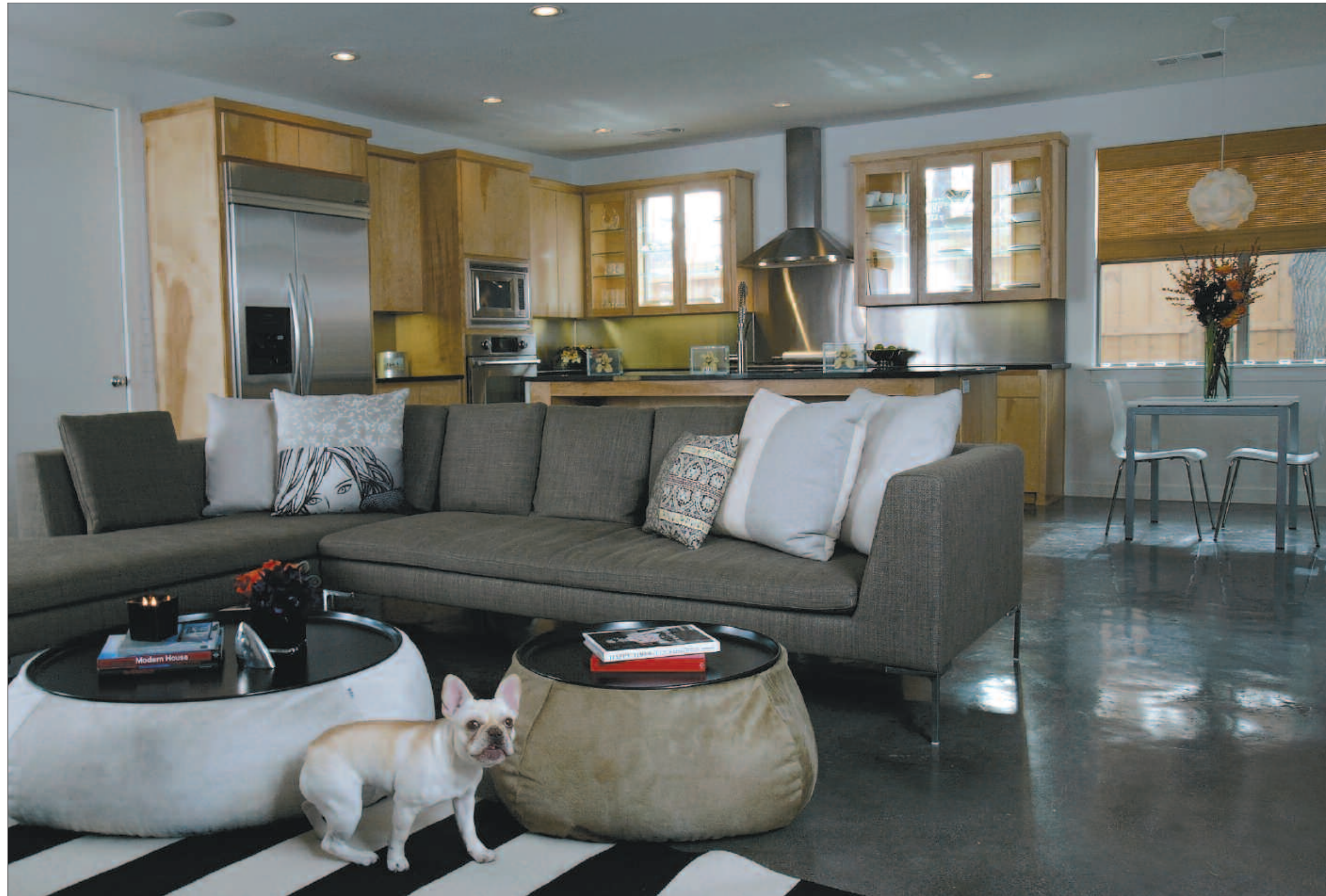
Kelle and Joe Jackson chose an open-style kitchen and living room outfitted with sleek stainless-steel fixtures and stream-lined furnishings from B & B Italia.